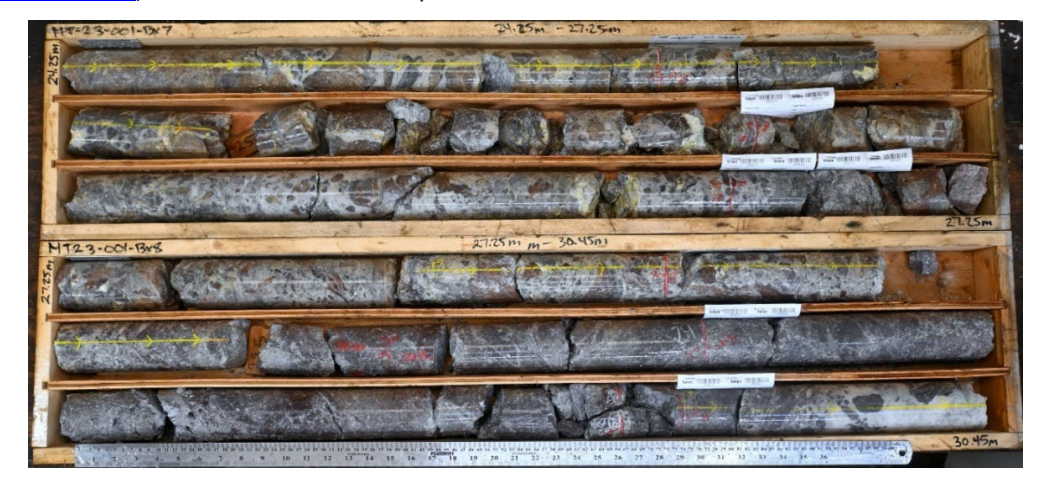
Image 1. MT23-001; mineralization grading 21.30 q/t Au and 1 q/t Aq over 7.0 m at 24.0 m depth.

TDG's Mets mining lease is a gold-rich 200-hectare developed prospect<sup>1</sup> with 8,784 m of historical diamond drilling<sup>2,3</sup> and 2,622 m of trenching<sup>2</sup> which took place between 1985-1990, and ~350 m of underground development<sup>2</sup> completed in 1991-1992. Development work ceased in late 1992, before production commenced. Mets is road accessible and located ~23 kilometres ("km") northwest of TDG's former producing Baker mine, mill and tailings storage facilities ( Figure 1 ). In October 2022, TDG received a 30-year extension to the Mets mining lease through to April 2053. In November 2022, TDG received the complete archive of historical work completed at Mets, including laboratory assay certificates<sup>2,3</sup>. In December 2022, TDG published a high-grade underground Exploration Target Range ("ETR") for Mets (see December 21, 2022) based on TDG's recompilation of the available historical information<sup>2,3</sup>.