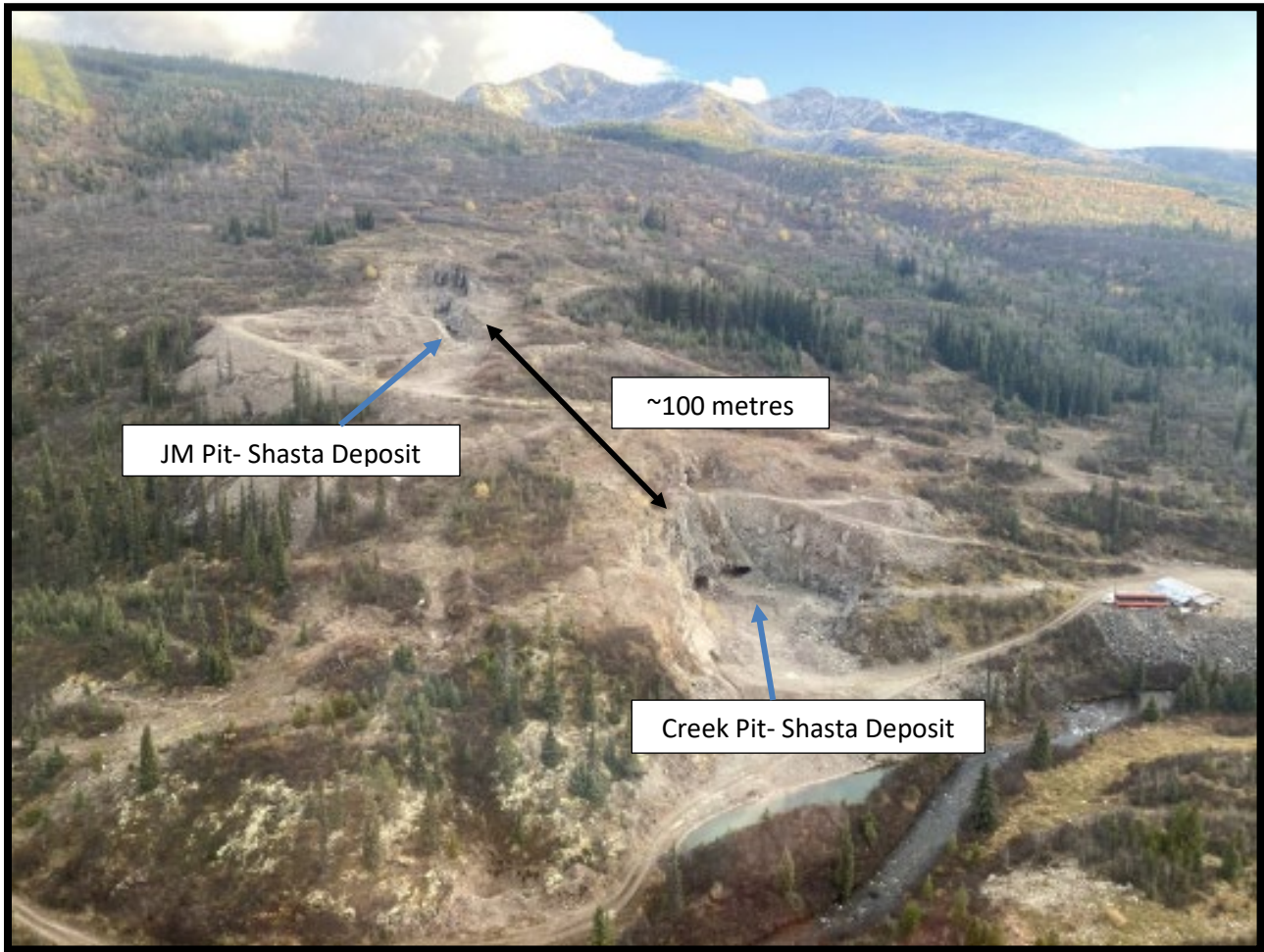
Image 1. Showing the location of the Shasta JM Zone pit and Creek Zone pit – looking approximately south-southwest.